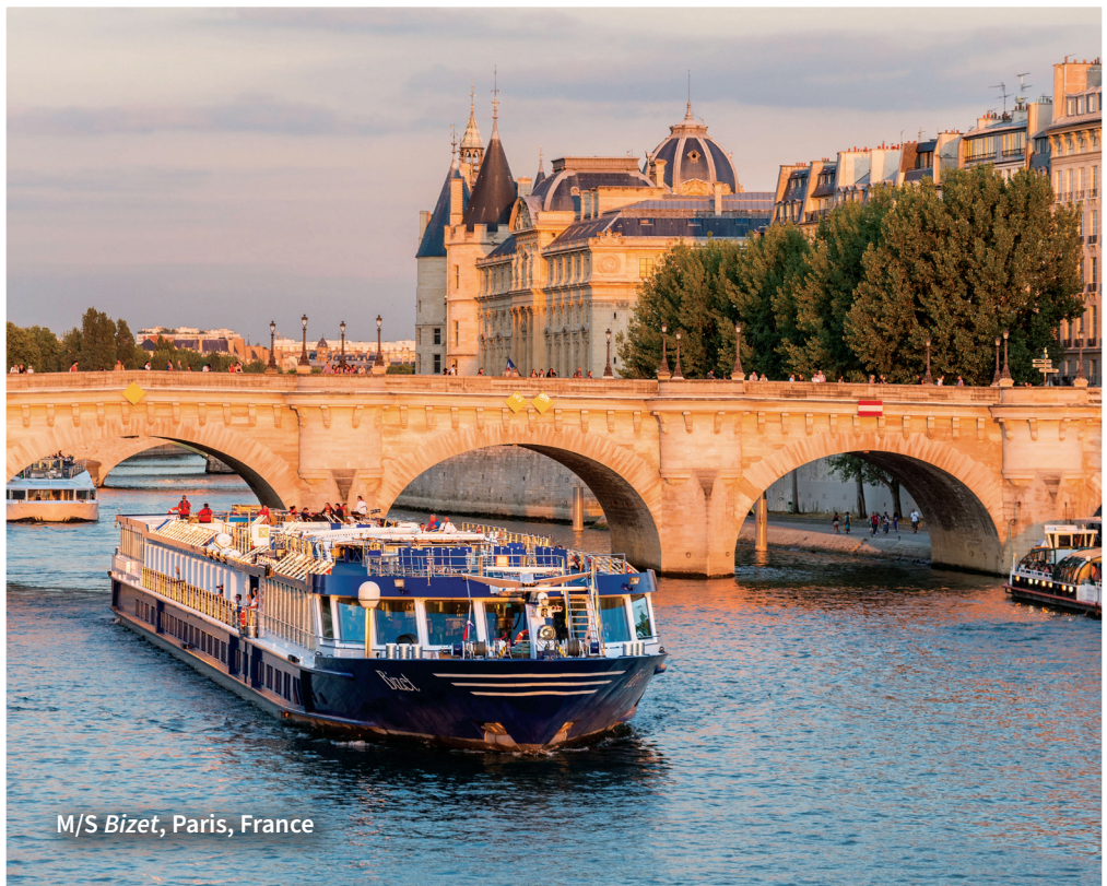
M/S Bizet, Paris, France

Embark on a full-day tour of D-Day discoveries, including a visit to Arramanche, and Pointe du Hoc. You'll also walk down to Omaha Beach, the six-mile stretch