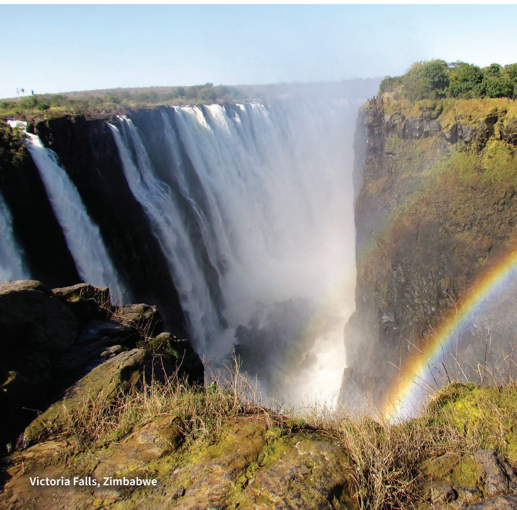
Victoria Falls, Zimbabwe