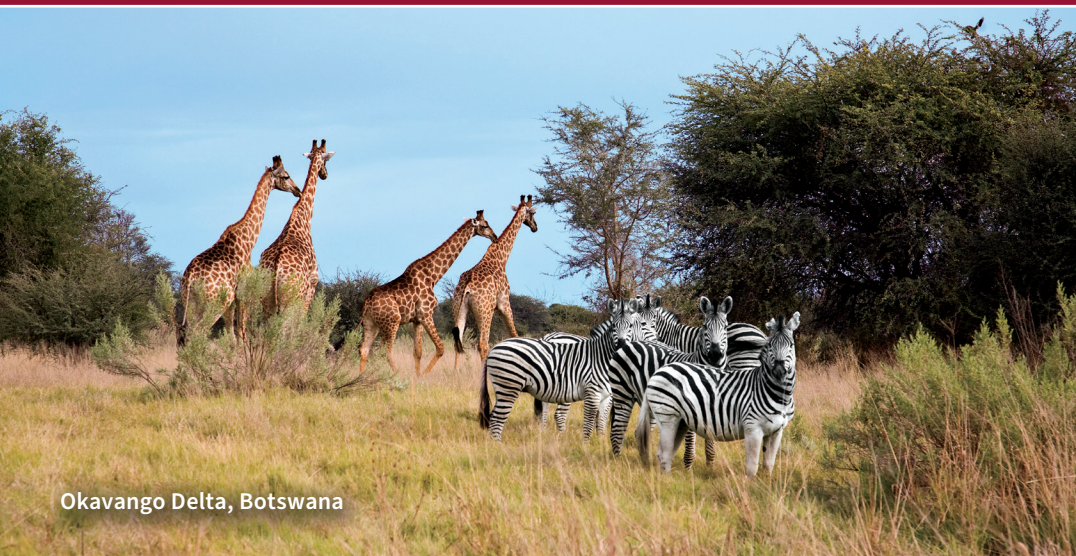
Okavango Delta, Botswana