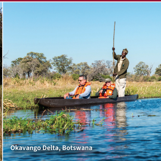
Okavango Delta, Botswana