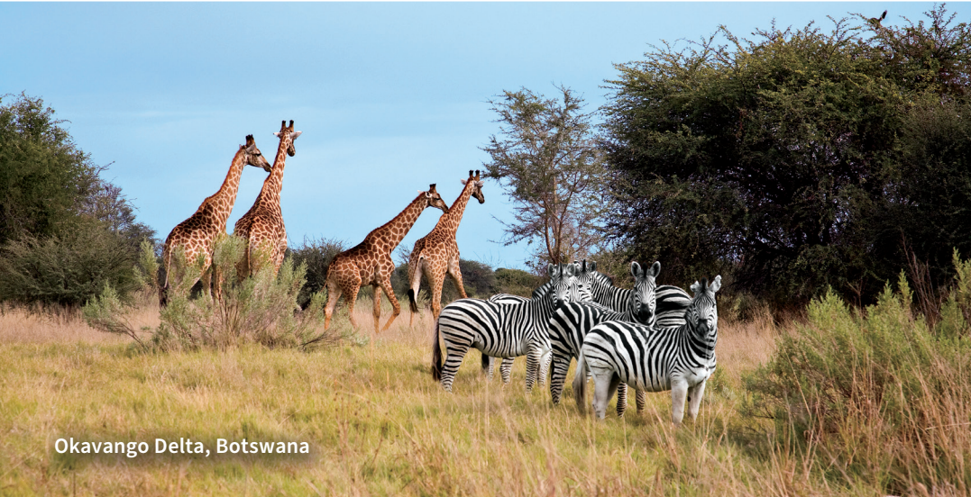
Okavango Delta, Botswana