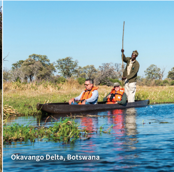
Okavango Delta, Botswana