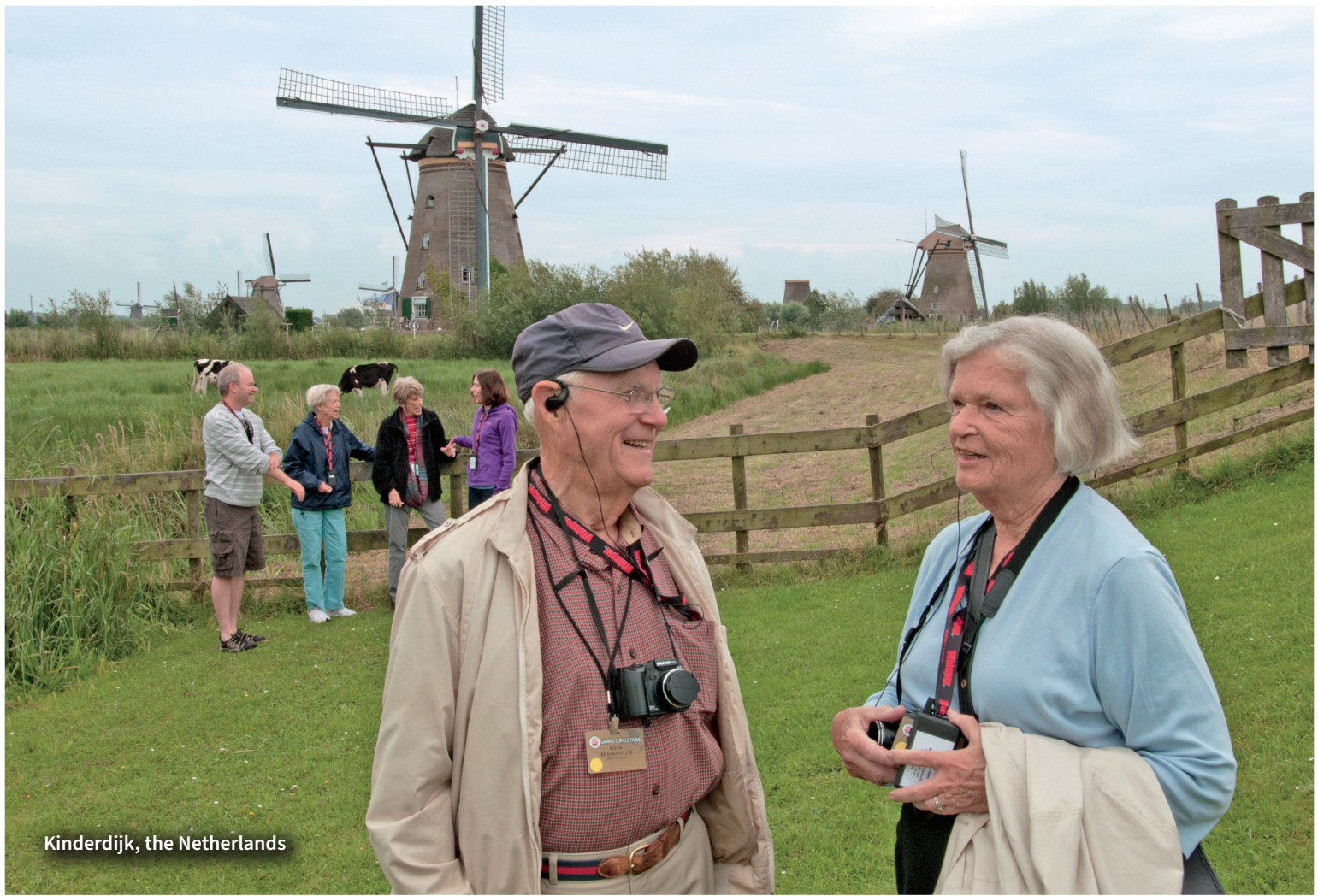
Kinderdijk, the Netherlands

factory and an hour of free time to make your own discoveries.